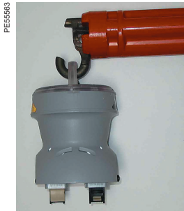
1 - Fixing the unit on the hook