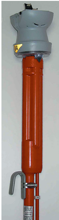
2 - Pushing the unit onto the line